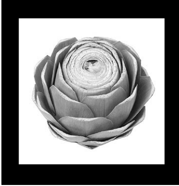
Globe artichokes ( Cynara scolymus ) are entirely edible stem and all.

This is the first round of production of our new globe artichoke crop. These artichokes were planted by hand in the greenhouse 6 months ago and were then transplanted in two long neighboring rows in our original Dungeness field.